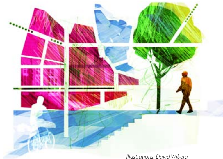
Illustrations: David Wiberg

Commissioner for City Ecology and Consumerism